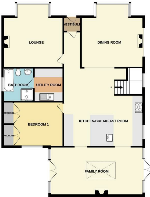
GROUND FLOOR 1319 sq.ft. (122.6 sq.m.) approx.