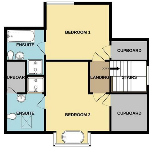
1ST FLOOR 624 sq.ft. (58.0 sq.m.) approx.